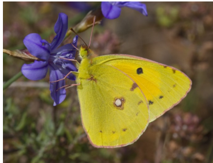
Clouded Yellow

Paradoxically, it was a personal Clouded Yellow year for me. It all started in mid-July near the NT car park at Sharpenhoe with a singleton sighting and then over following six weeks I saw another five there. At Canvey Wick, on my field trip, we saw at least four and on other visits there I found another three. On the Benfleet Downs I recorded seven including a very late sighting of a pair (with a Peacock) nectaring on a patch of yellow Cats Ear during a walk to inspect the new mountain biking route on an Indian Summer - like day in late October.